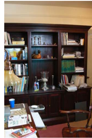
Interior: Second Floor Study

Distinctive, unusual carved trim is seen in the eared architraves above the door (left) and built-in shelving (right): The grey striè glaze matches the original. Also seen are the restored double-glazed finish on the tripartite walls, and the picture moulding and chair rail.