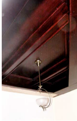
Interior: First Floor Pantry

Greek Revival trim shows here on the right door casing, and also appears on the double windows behind the camera; also shown are the Shaker trim and picture moulding above the sconces, the tall baseboard, and the wide plank floor. The glazed wall finish is original, and the aged copper chandelier and sconces are period.