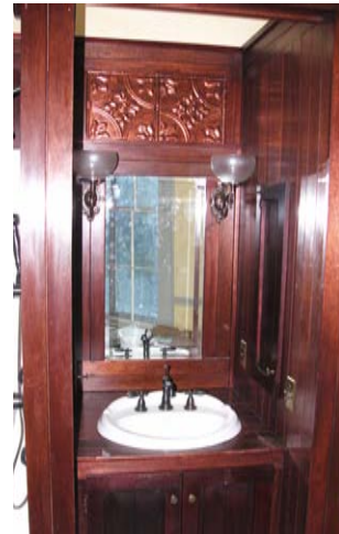
Interior: First Floor Bathroom

The coffered mahogany Pantry ceiling is seen above, with a period pendant fixture in aged brass.