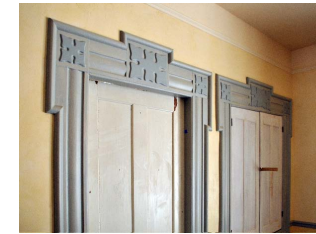
Interior: First Floor North Parlor

The period mahogany surround with copper panels is seen above, with the sink centered, shower to the left, and toilet to the right, both enclosed by portières. The hardware is Venetian Bronze; the wall and ceiling fixtures are flashed copper; and the push-button light plates are aged brass.